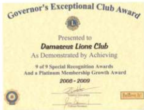
Governor's Exceptional Club Award