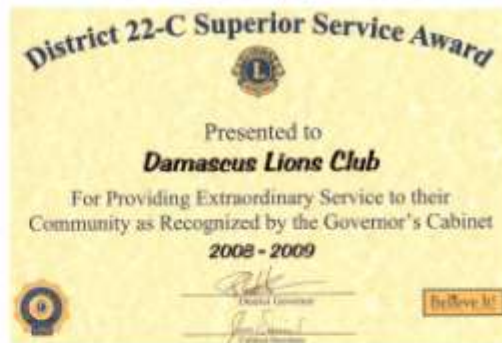
District 22-C Superior Service Award