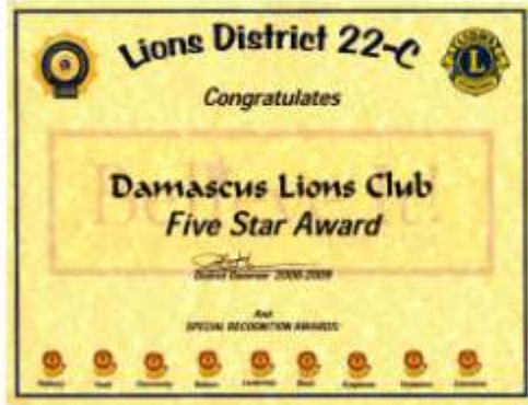
Five Star Award with all 9 Special Awards