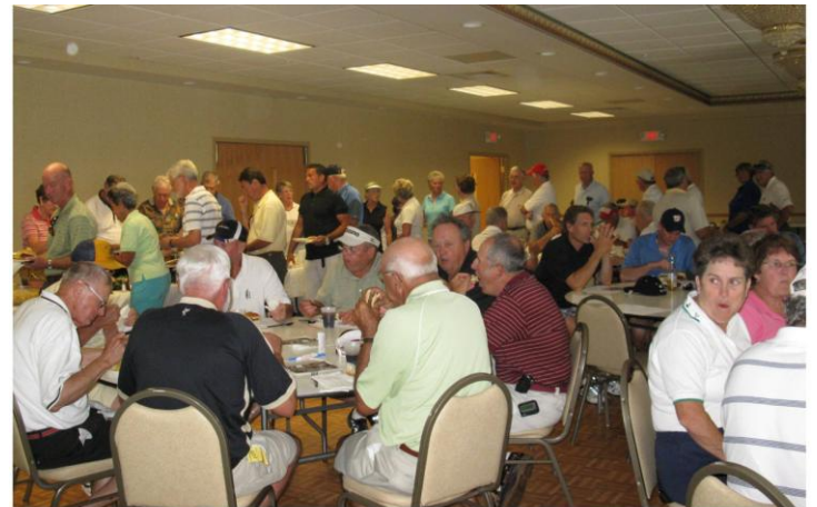
Good eats after a game of golf Damascus Lion's golf Tournament 2009