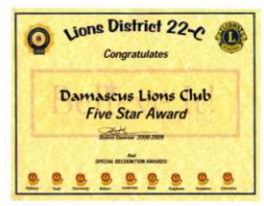
Five Star Award with all 9 Special Awards