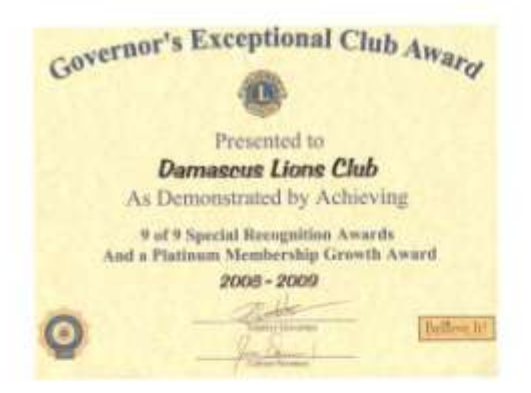
Governor's Exceptional Club Award