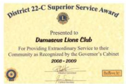
District 22-C Superior Service Award