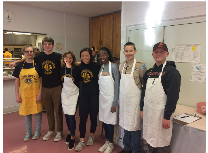
Leos and Scouts Helping Out !