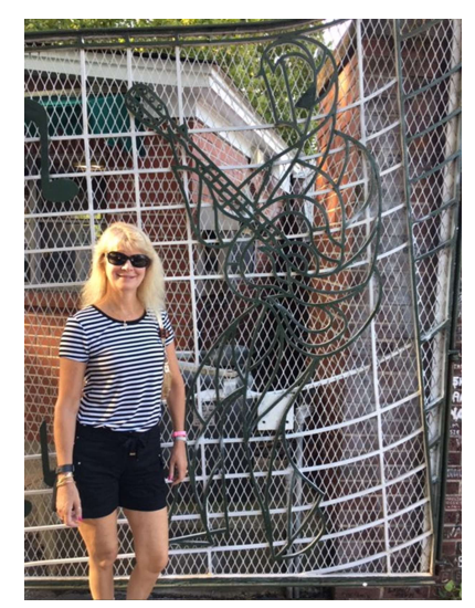
Can you Guess Where I am ?

It's not how much you have that makes people look up to you, it's who you are.