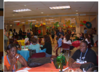
CHS Students enjoy Party