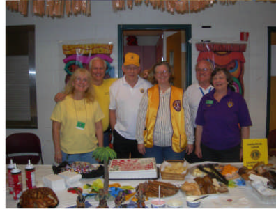
above 2nd shift