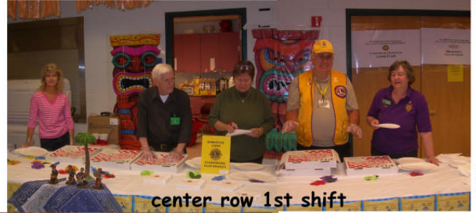
center row 1st shift